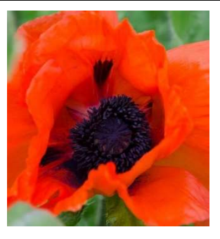
'Beauty of Livermere' Oriental poppy

During its short season of bloom, the flamboyant Oriental poppy dominates the garden, showing off huge scarletorange blossoms measuring up to 8 inches across. Plants go dormant in the summer, so mix them among other tall perennials or annuals to mask the browning foliage.