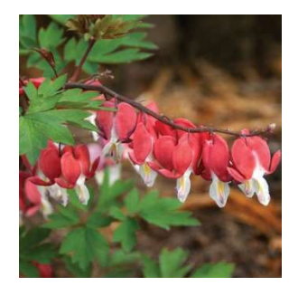
Valentine® old-fashioned bleeding heart