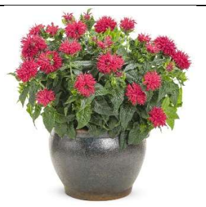
"Pardon My Cerise" bee balm