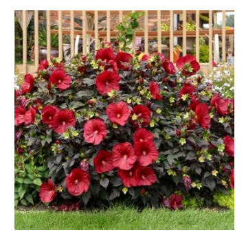
Summerific® 'Holy Grail' rose mallow (HIBISCUS)

Height/Spread: 4 to 4-1/2 feet tall, 5 feet wide Rich, deep red flowers nearly 9 inches across beautifully complement this plant's lush near-black foliage. Unlike tropical hibiscus, rose mallow is a hardy hibiscus tough enough to overwinter outdoors in colder climates.