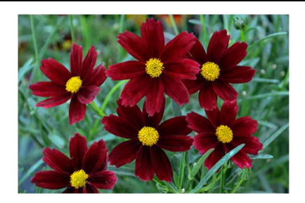
Li'l Bang™ Red Elf tickseed (COREOPSIS)