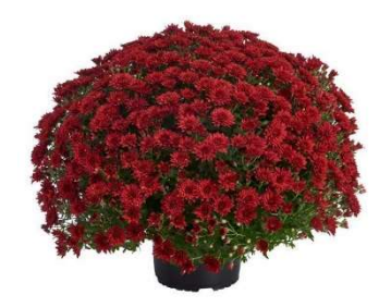
Morgana Red garden CHRYSANTHEMUM