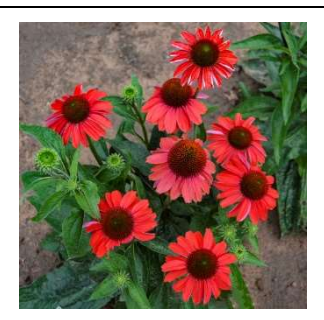
Color Coded® 'Frankly Scarlet' coneflower