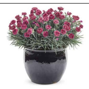
Fruit Punch@ 'Cherry Vanilla' (DIANTHUS)