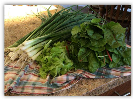
The Barrie Garden Club at the Shear Park Community Garden!

Our Volunteers have planted and are now starting to harvest produce at our Shear Park Plot! Thanks for all of your wonderful work! We take our fresh bounty over to the Barrie Community Fridge on Churchill drive!